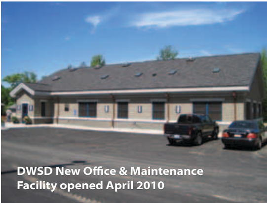
DWSD New Office & Maintenance Facility opened April 2010

Presorted Standard U.S. Postage PAID Permit No. 211 Dracut, MA